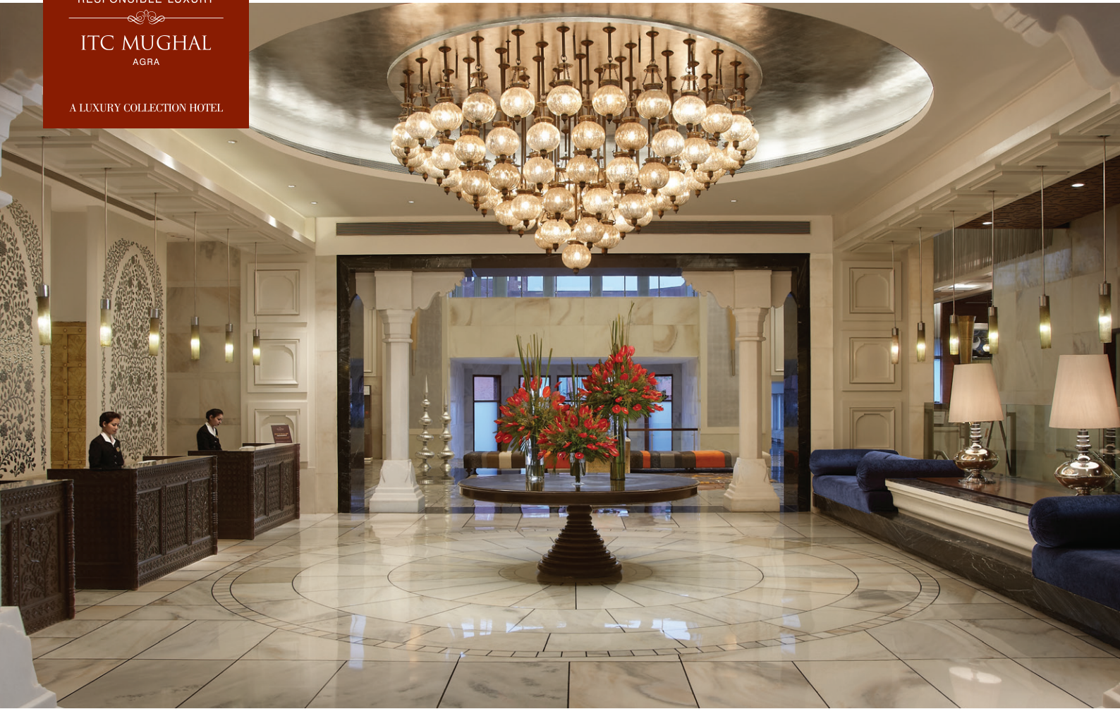
Akbar Mahal – Grand Mughal Lobby, ITC Mughal, Agra