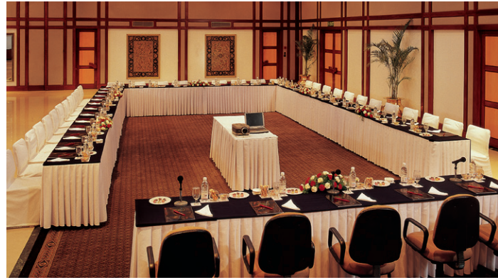
U-shaped seating, Dewan-E-Khas – ITC Mughal, Agra

In the city of the Taj Mahal, conferences are as lavish as the Mughal durbars and the extensive lawns make ideal party venues. There's an impressive pillarless, namely Dewan-E-Khas of size 636 m 2 hall with a pre-function area overlooking the lush green gardens which can accommodate 750 guests (theatre-style) and 900 guests for receptions. Dewan-E-Khas is divisible into three equal areas accommodating 250 guests each. Additionally, Majlis of size 224.8 m 2 , which is also divisible into two halls for up to 50-175 guests are also available. The Sher-Shah Suri can host upto 1500 guests.