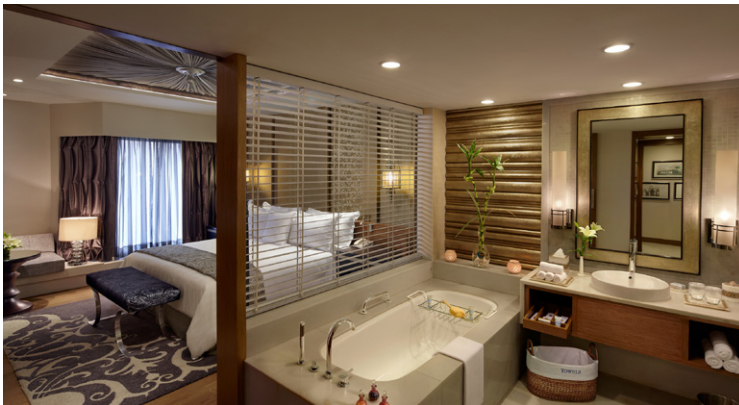
Royal Mughal Suite – Bedroom and Luxury Bath, ITC Mughal, Agra

Drawing a fine balance between luxurious accommodation and executive efficiency, the Mughal Chambers (33 m 2 ) offer elegantly appointed spacious rooms for discerning business travellers.